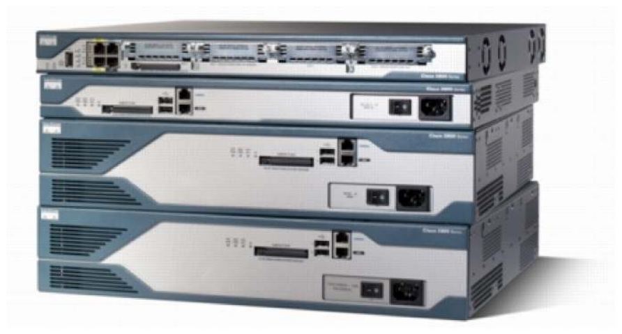
Figure 1. Cisco 2800 Series

Cisco Systems<sup>®</sup>, Inc. is redefining best-in-class enterprise and small- to- midsize business routing with a new line of integrated services routers that are optimized for the secure, wire-speed delivery of concurrent data, voice, video, and wireless services. Founded on 20 years of leadership and innovation, the Cisco<sup>®</sup> 2800 Series of integrated services routers (refer to Figure 1) intelligently embed data, security, voice, and wireless services into a single, resilient system for fast, scalable delivery of mission-critical business applications. The unique integrated systems architecture of the Cisco 2800 Series delivers maximum business agility and investment protection.