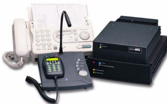
9001 Fax and Data Interface with fax machine and NGT

All Codan equipment is built to survive in extreme conditions and comes with full product support. A three year warranty is available to every registered user.